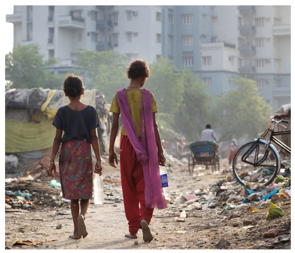
Housing for the wealthier middle classes rises above the insecure housing of a slum community in Lucknow, India.