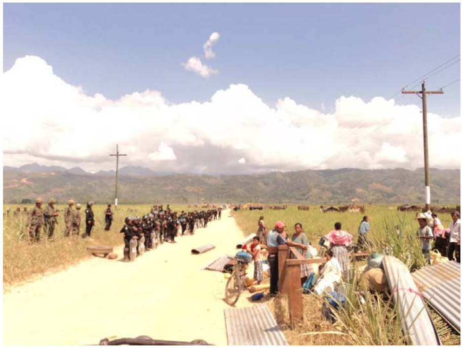
Miralvalle, Polochic Valley, Guatemala, 15 March 2011. The community was evicted, their houses and crops destroyed.

The new wave of land deals is not the new investment in agriculture that millions had been waiting for. The poorest people are being hardest hit as competition for land intensifies. Oxfam's research has revealed that residents regularly lose out to local elites and domestic or foreign investors because they lack the power to claim their rights effectively and to defend and advance their interests. Companies and governments must take urgent steps to improve land rights outcomes for people living in poverty. Power relations between investors and local communities must also change if investment is to contribute to rather than undermine the food security and livelihoods of local communities.