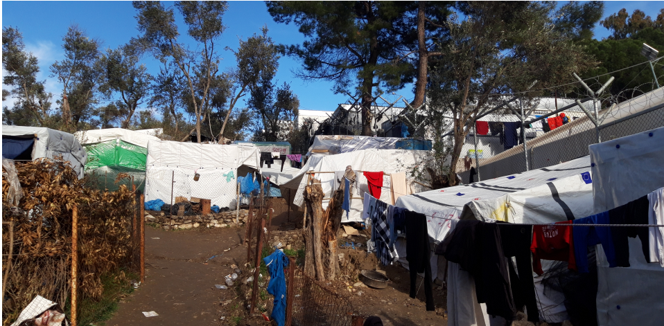
The extended area outside Moria camp in Lesbos, Greece, also called 'the jungle', where the vast majority of asylum seekers are left to survive on their own means - February 2020.